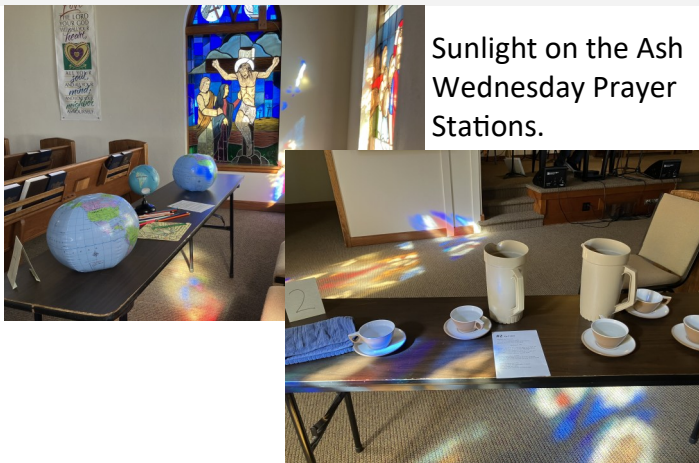
Sunlight on the Ash Wednesday Prayer Stations.

What's that new song? Check out our church Worship Music Playlist to hear some of the new music before Sunday mornings.