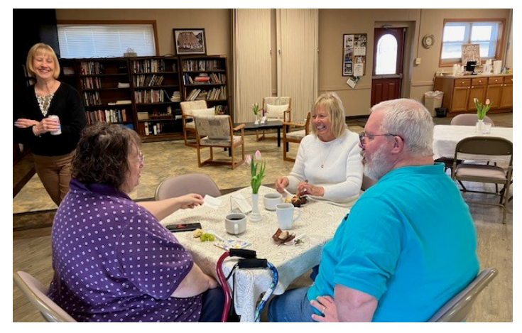
Millard Community Covenant Church – March 24, 2024

Coffee, Conversation and Calories & good company!